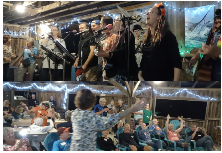
The ever-popular Corn Funk Revue entertained Oyster Roast partiers, many of whom danced and joined into singing old favorites such as "Sweet Caroline."

Participants were able to visit a series of rest stops, where they were offered water, fruit, and "facilities" at locations selected for their accessibility and attractiveness. Lunch was provided at Cedar Grove, a beautiful bayside farm between Machipongo and Franktown. The evening after the Bike Tour, a lucky group was treated to great food and entertainment at the ever-popular Oyster Roast. A good time was had by all, guests and volunteers alike!