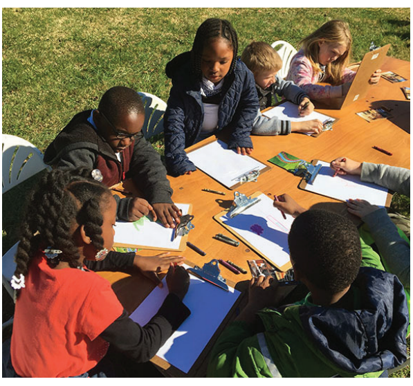
Before COVID, second-graders visited Brownsville Preserve for a field trip with VES Land Trust. These students draw what they saw (pine trees, holly trees, vultures, cattails, and more) on the Birding and Wildlife Trail.

Informal educators saw a need to lend teachers a hand, meet students where they are, and provide printed educational activities. Teacher professional development leverages school yards as a safe learning environment. Printed activities address the internet connectivity challenge and the digital burnout that so many are experiencing in the age of endless Zoom classes and meetings. The activities also "support place-based, student-centered, and outdoor learning, all of which have