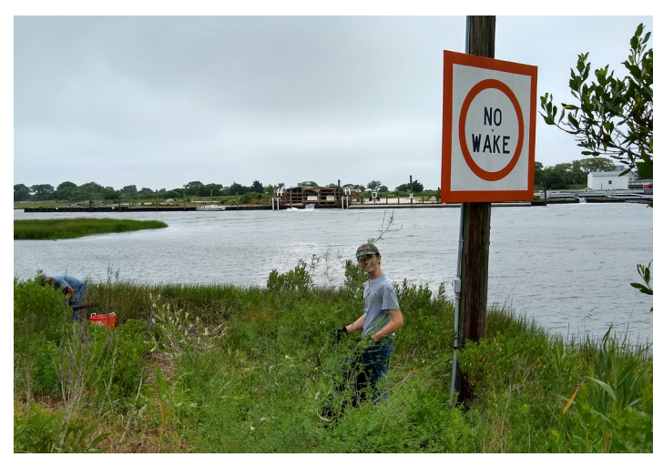
Pick your own Bay Watershed clean-up spot, grab a friend, and register for the 2021 CBF Clean the Bay Day event, which has been extended to a full week, from May 31 to June 5.