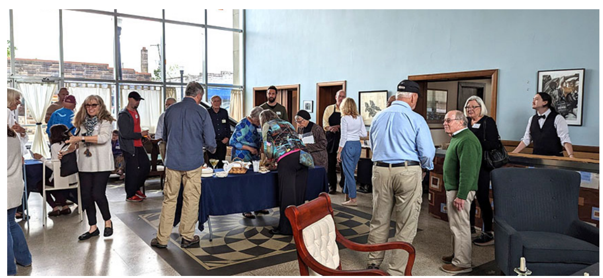
An innovative, new event space, the Exmore Social Hall, hosted CBES volunteers with delicious food and drink, and enthusiastic hospitality.