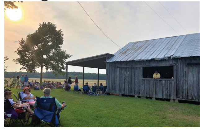
Weather was perfect for neighborly conversations around Cherry Grove's vintage barn.