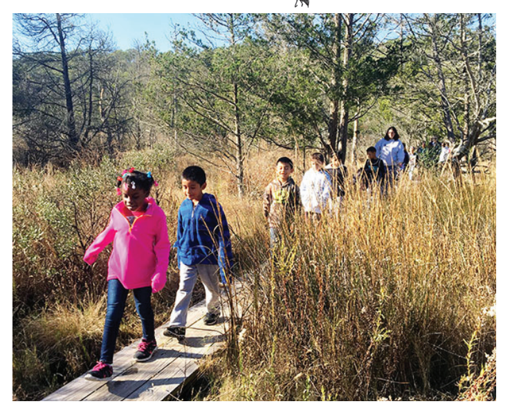
Accawmacke Elementary School second-graders enjoy a November nature walk at Brownsville. See story on page 5.

As to future CBES Bike Tours, we hope these successful partnership spinoffs continue. \widehat{\begin{array}{c}}