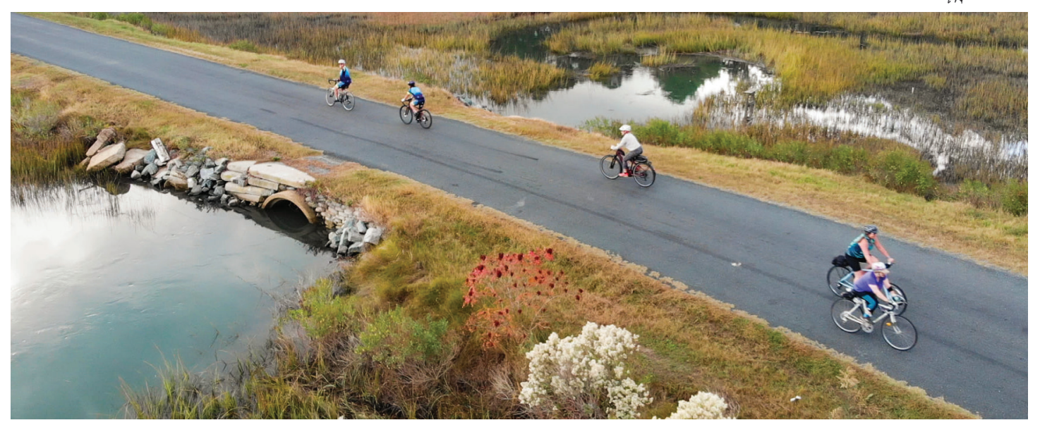
Oh, the places they did go! Cyclists wend their way to and from UVA's Anheuser-Busch Coastal Research Center in Oyster, where they were treated to catered lunches and live music. Participants in this year's Bike Tour echoed comments from past tours, citing the beauty of the Shore and the friendliness of Shore residents.