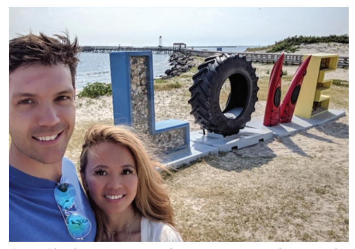
Cape Charles is enjoying a booming tourist industry, with many visitors taking photos with the iconic LOVE letters, made of (L-R) shells, a tractor tire, kayaks, and crab pots.

But neither Shore county has a funded, professional marketing outreach program. Several rural Virginia counties, competing in the same tourism market, have established, and funded, in-house marketing and promotional offices that stress outreach as part of an economic development plan: from Rockingham County, "The overarching goal of the Tourism Department is to develop