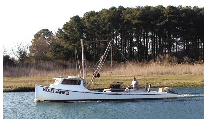
The Violet Jane returns to home port in the village of Oyster, which has an active working waterfront and hosts many participants in the Shore's aquaculture industry, incuding a hatchery and a seafood company.

and implement a tourism strategy with an economic development component that promotes the county as a premier travel and tourism destination"; and "This (Tourism) division is responsible for Orange County's tourism promotion efforts, committed to raising awareness of the county as a tourism destination, and promoting its interest and name recognition – locally, nationally and internationally.... A marketing and promotion-driven operation..."