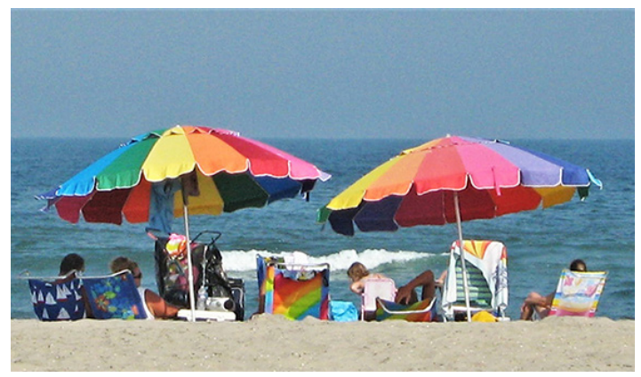
Beautiful public beaches in both counties offer wonderful opportunities for families and others to enjoy a sandy day on the Shore.

Several information and data analysis organizations are reliable resources for news organizations, corporations, and the general public, where comparisons can be made among state and regional communities — when planning for retirement, corporate relocation, or a lifestyle change. Using similar sources as CNBC, communities' profiles, including their assets or deficiencies, are compared. One of the best known, and most popular among people