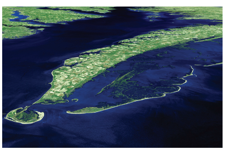
Aerial view of the Eastern Shore of Virginia, looking northwest from the southern end of Northampton County.