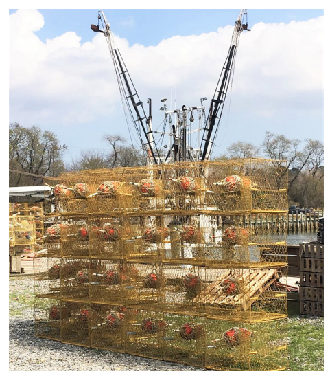
Crab pots stacked at Cape Charles Marina wait to be placed in the Bay.

work boat docking competition and Blessing of the Fleet in Cape Charles, to a competitive decoy carving festival in Chincoteague, the Shore's towns each have something special to offer.