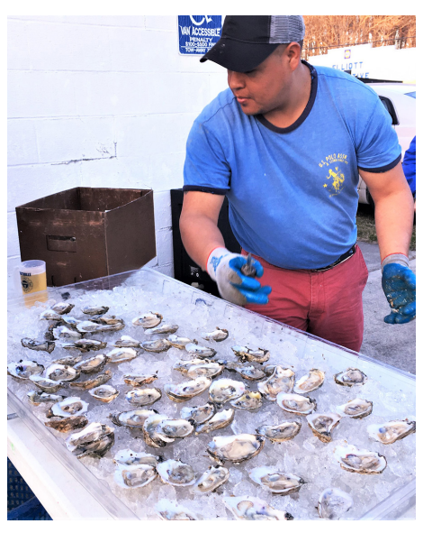
Community oyster roasts keep bringing visitors back to the Shore.

The April 2018 ShoreFacts included a reference to "572 million pounds of ammonia emissions each year." This should have read 15 million pounds. We apologize for this error. The article "Ready, Set, Go!," on Eastern Shore Farmers Markets in the April 2018 ShoreLine , did not include Parksley market and Wallops Island market (opening Thursday, May 3).